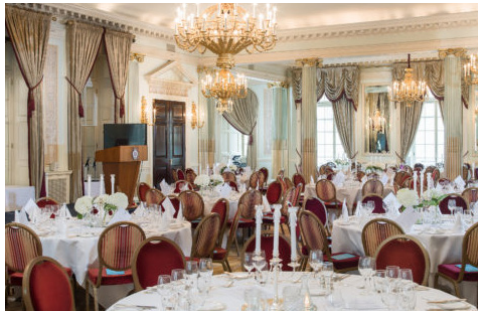
The Mountbatten Room

The Royal Automobile Club is situated on the southern side of Pall Mall, towards St James's Street.